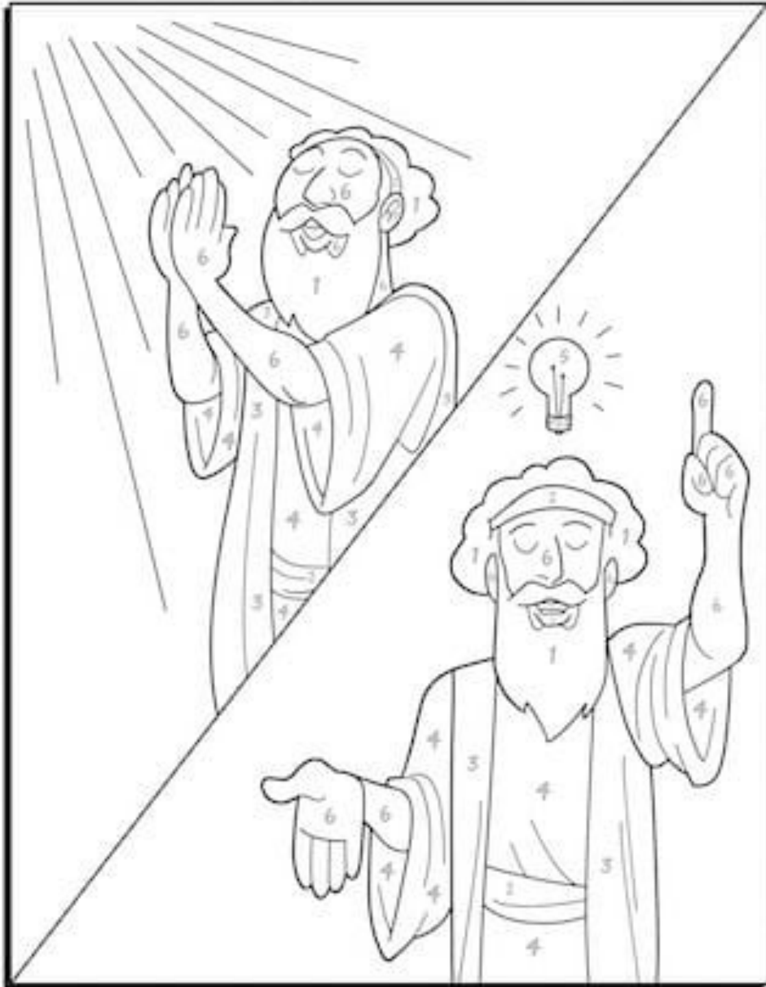
Solomon prays for wisdom and becomes the wisest man ever.