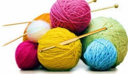
Prayer Shawl Ministry

After Mass, please stop in the school cafeteria for breakfast sponsored by Scout Troop 123, Cub Pack 206, and Girl Scout Troops 940 and 944.