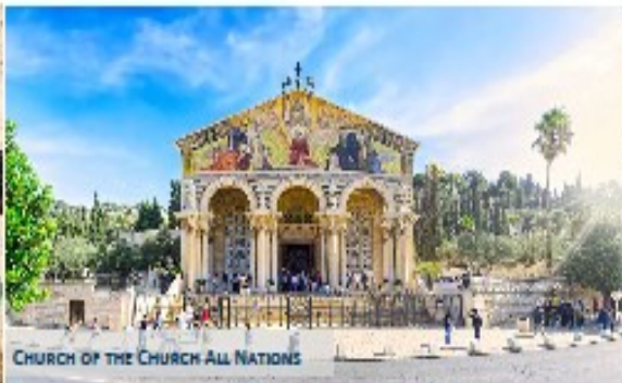
CHURCH OF THE CHURCH ALL NATIONS