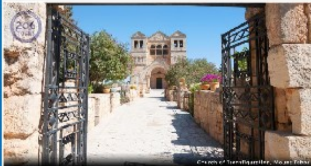
Church of the Transfiguration, Nazareth, Israel