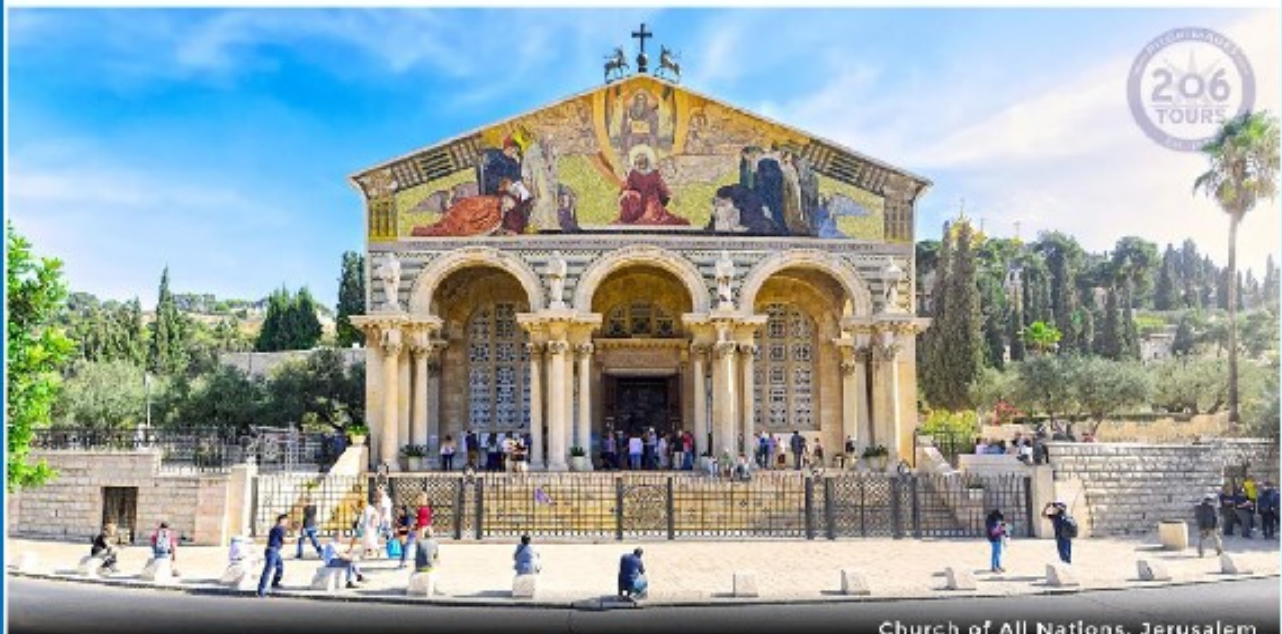
Church of All Nations, Jerusalem