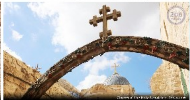
Church of the Holy Sepulchre, Jerusalem