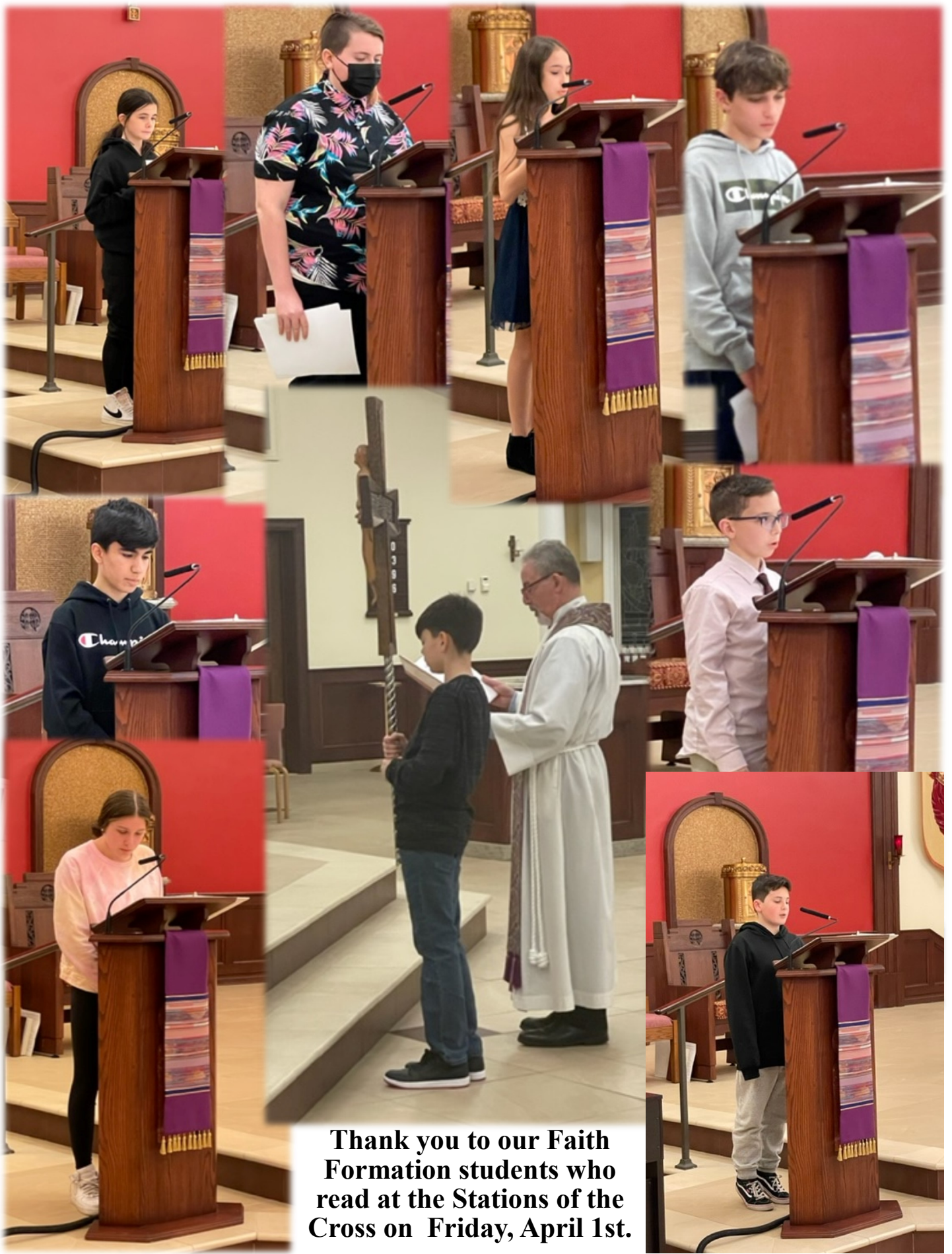
Thank you to our Faith Formation students who read at the Stations of the Cross on Friday, April 1st.